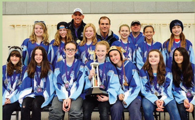
The Ravens received a program grant, then raised money for a local children’s hospital.

The ringette team was delighted about first receiving the funds from Investors Group and then deciding to “pay it forward” and give back to children in their community.